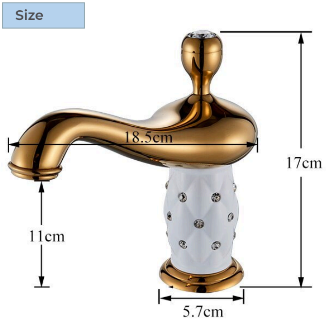
Product shown is only for installation display purpose