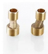
Buried water pipe